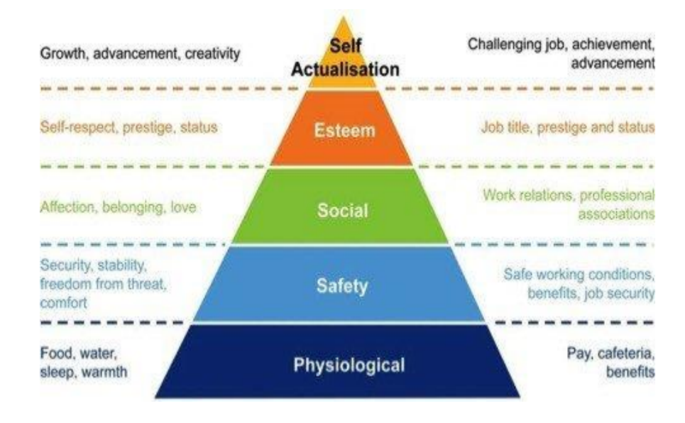
Figure 3: Maslow Hierarchy of Needs

GLCs Malaysia faced difficult in retaining qualified talent in every sector. In the face of this challenge, GLCs are recommended to adopt theory of Maslow Hierarchy of needs to enhance retention rate for pulling the talent turnover rate downward and reinforce employee engagement. Maslow Hierarchy of needs is an example of human motivation in aspect of life including work life. It is a pyramid to describe, identify and categorize the employee needs from the bottom of pyramid and move up each level to the top of pyramid to ensure that every employee's needs are met or achieved. At the workplace, the needs will transfer to the workplace and organization need to identify and understand the workforce needs and wants contribute toward employee job satisfaction, resulting in lower turnover and improve talented employee retention (Employee Retention and Psychology, 2016).