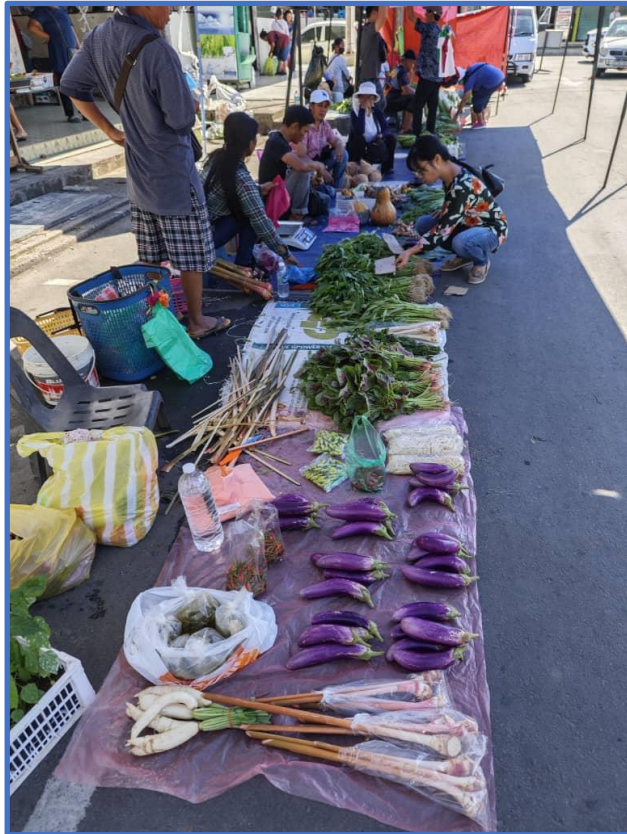
Photo 6: Local Farmers Showcasing a Variety of Fresh, Colourful Vegetables