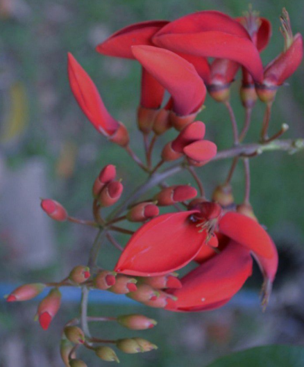
The Pride Of Burma ( Amherstia nobilis )