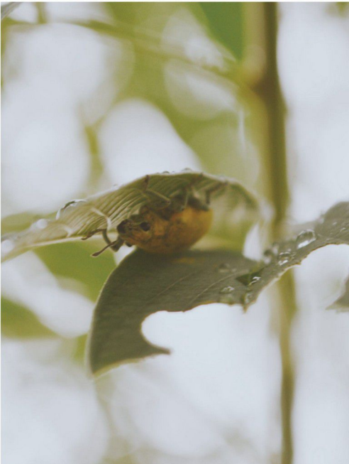
Green Weevil ( Phyllobius argentatus )