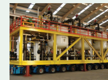
3. Technical Training Programmes