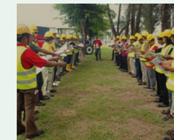
1. Core Executive Programme (CEP)

There are several programmes and modules conducted by Sime Darby under training & development as follow: