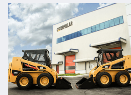
3. China Engineers Limited Training Department, Singapore