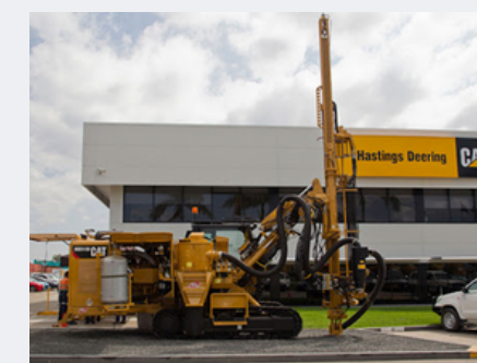
1. Hasting Deering Institute of Training, Australia

Sime Darby is determined to continue in engaging with all its employee in a positive and equitable way, acknowledging their potentials by investing in adequate training and development programmes. They have developed few Caterpillar accredited training campuses throughout the region by providing general, mechanical and technical training in maintenance as well as repairs and operation of heavy machinery.