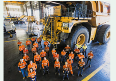
4. World-Class Management Training in Easily Accessible On-Demand Modules