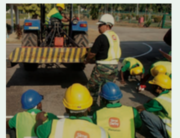
2. Targeted Leadership Programmes