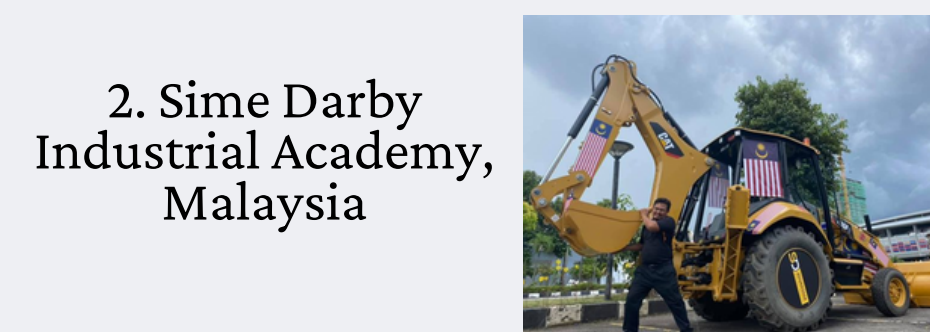
2. Sime Darby Industrial Academy, Malaysia