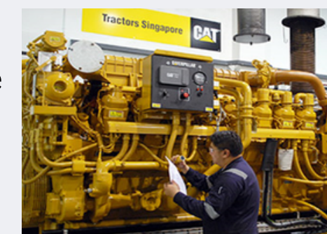
4. Tractors Singapore Limited Training Department, Singapore